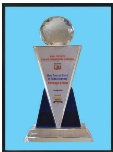
ET Real Estate Grand Champions Awards- Most Trusted Brand in Redevelopment Projects 2021