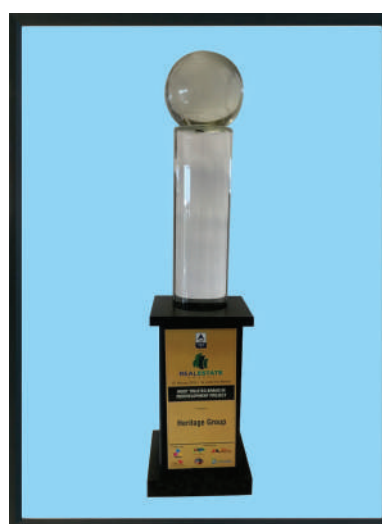
TIMES PROPERTY - 2016 MOST TRUSTED REAL ESTATE BRAND OF THE YEAR