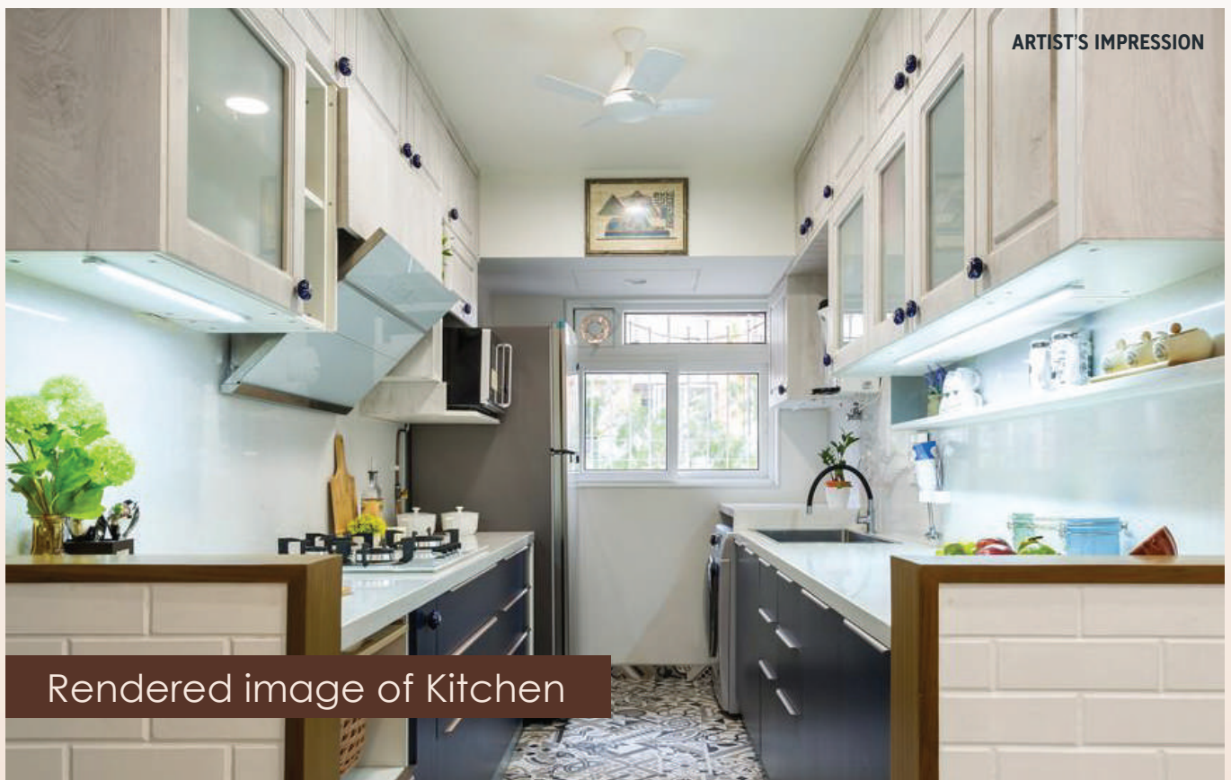
Rendered image of Kitchen