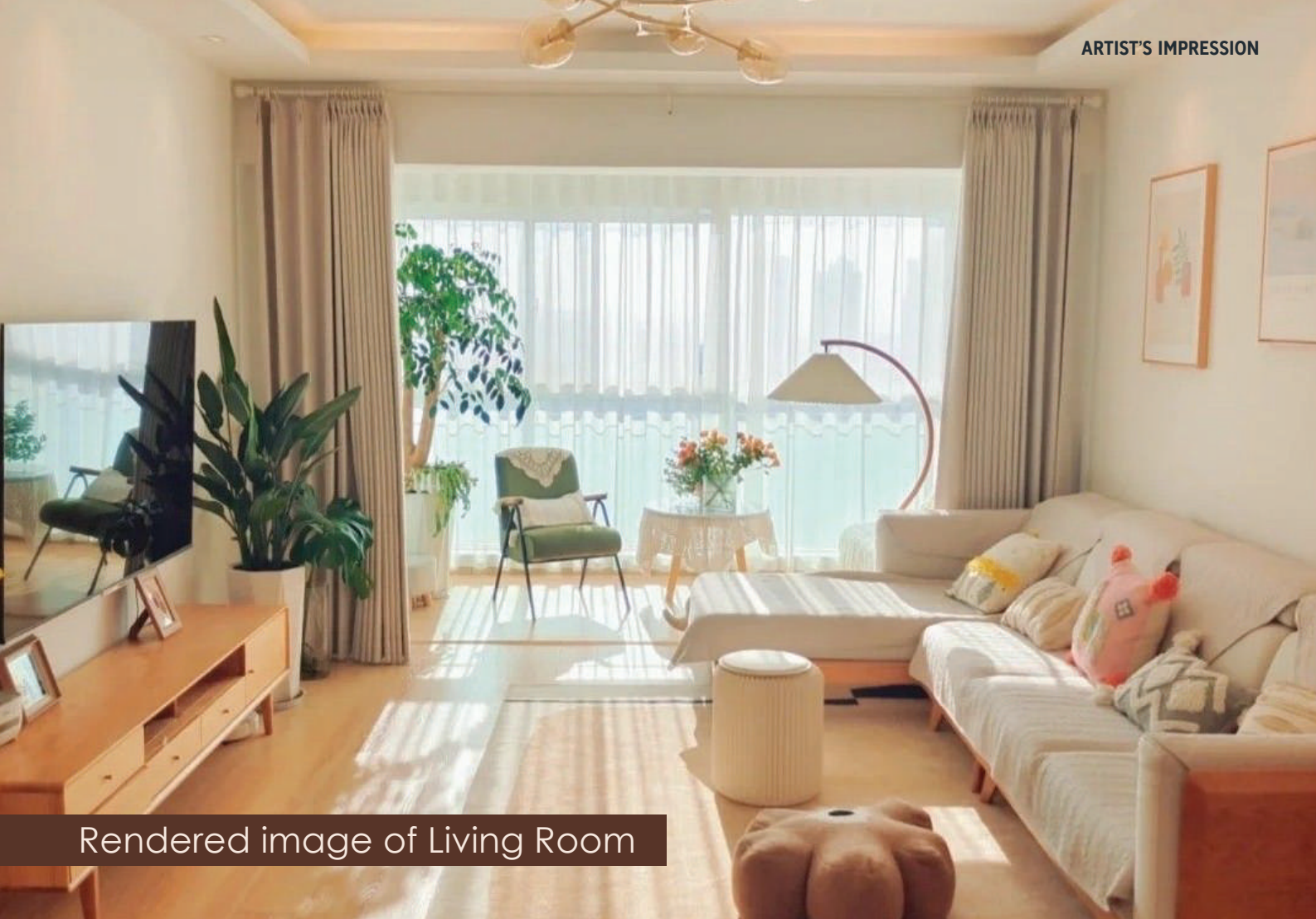
Rendered image of Living Room