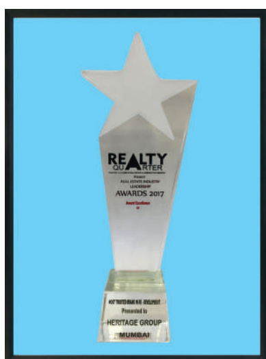
REALTY QUARTER AWARDS 2017- MOST TRUSTED BRAND IN REDEVELOPMENT PROJECT