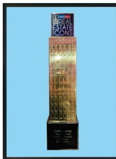
Mid-Day Real Estate Icons Awards For Heritage Pride-2018